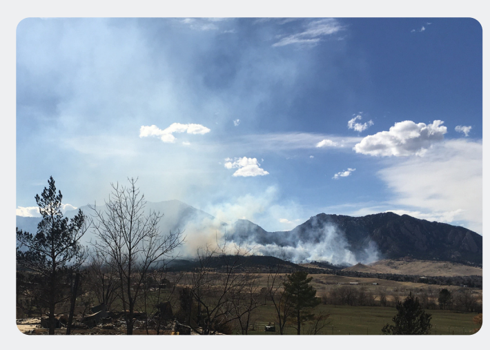
NCAR Fire March 27, 2022