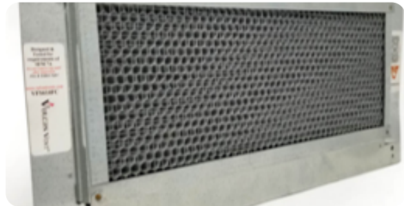
FIRE-STOPPING GABLE VENT